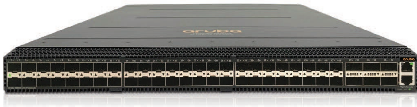
HPE Aruba Networking CX 10000 Switch Series

Notes: 1 Supported in future software release.