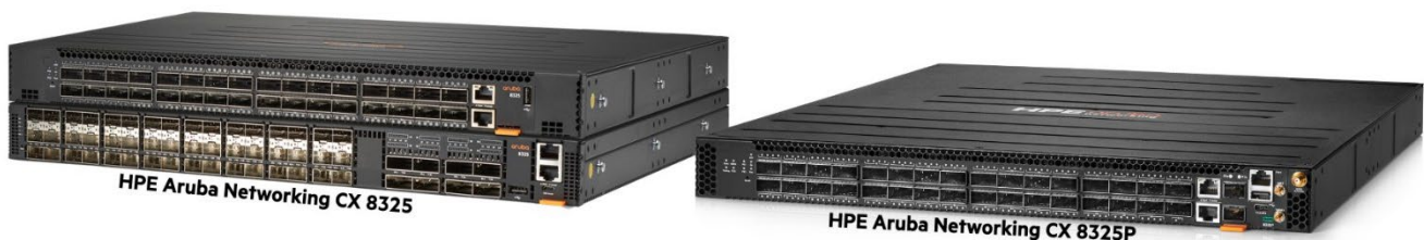
HPE Aruba Networking CX 8325 Switch Series

The CX 8325 switch series is designed with Quality of Service (QoS) features, full-featured Layer 2 and Layer 3, and advanced EVPN-VXLAN features. For enhanced visibility and troubleshooting, the HPE Aruba Networking Network Analytics Engine (NAE) automatically interrogates and analyzes events that can impact a network's health. Advanced telemetry and automation provide the ability to easily identify and troubleshoot network, system, application, and security related issues easily, using python agents, CLI-based agents and REST APIs.